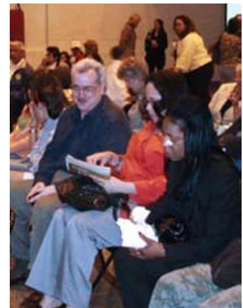
One of NAMI's community outreach efforts. Families can attend the many seminars and support groups offered by NAMI.

Nearly all of the mental health agencies in our area are members of NAMI and refer clients and families to their many programs. There are currently eleven support groups and three distinct nine to twelve week educational programs offered. In 2006, more than 5,000 people used their services. NAMI has identified the need for more programming specifically for Cleveland's Hispanic community. The west side of Cleveland is home to the largest Hispanic population in the area, and studies estimate that over 3,000 Hispanic adults, and nearly 2,000 Hispanic children, are in need of mental health services.