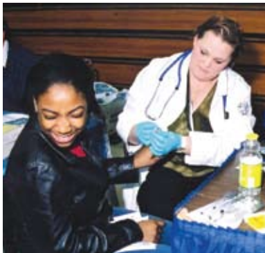
A Tri-C student performs a health screening in the community

C uyahoga Community College Foundation received a $20,000 grant from the Foundation for