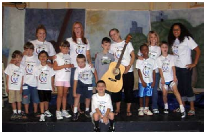
Kids and volunteers interact at the summer camp filled with exciting activities.